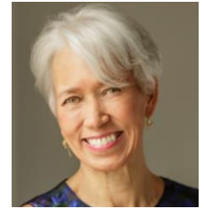
February 1 st Dr. Nina Jablonski Evan Pugh University Professor Pennsylvania State University Understanding the Evolution and Meanings of Human Skin Color is Important